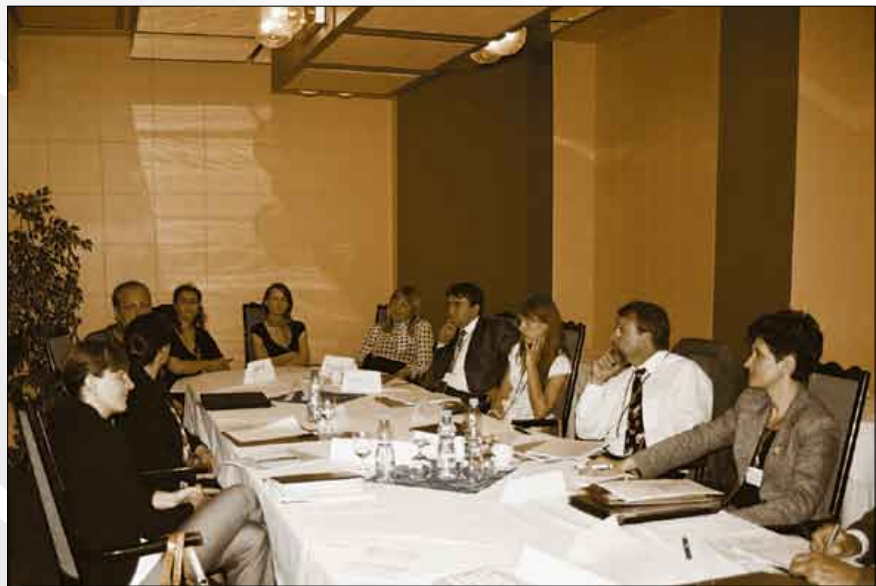
Working Group on Integrity in Public Governance

The paper from Slovenia was an empirical study of efforts for